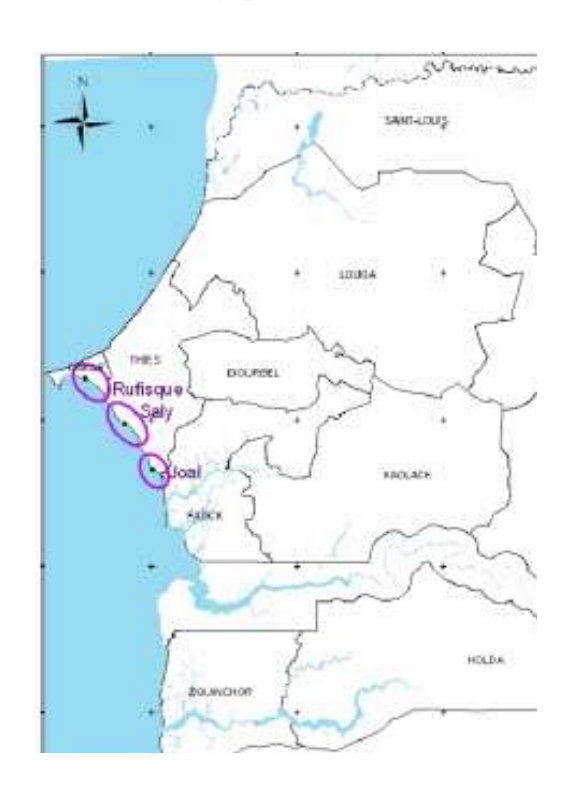
Location of the 3 sites Rufisque, Joal, Saly from the Appendix Proposal of Senegal

work. In contrast, the approved proposal of Honduras only mentions to work through UNDP and a government agency as Executing Entity, the "national" Secretariat Environment and Natural Resources (SERNA);